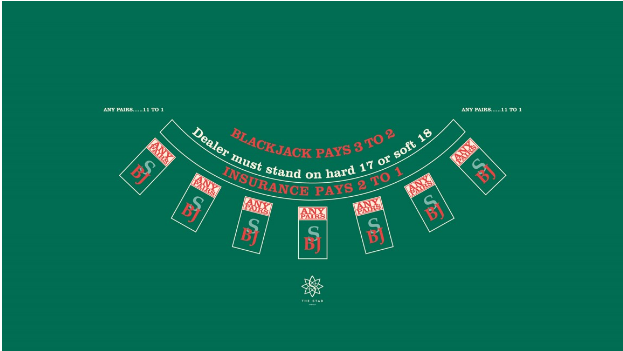
Indicative table design, actual design and optional wagers may differ on the casino floor to what is shown above.