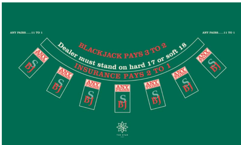
Indicative table design