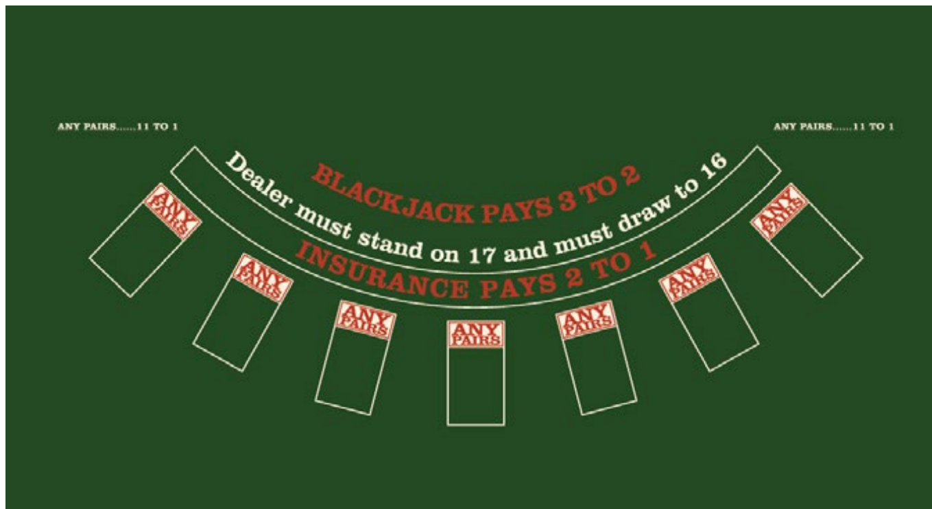
Indicative table design

hand where the first two cards dealt, in the initial deal only, are either: