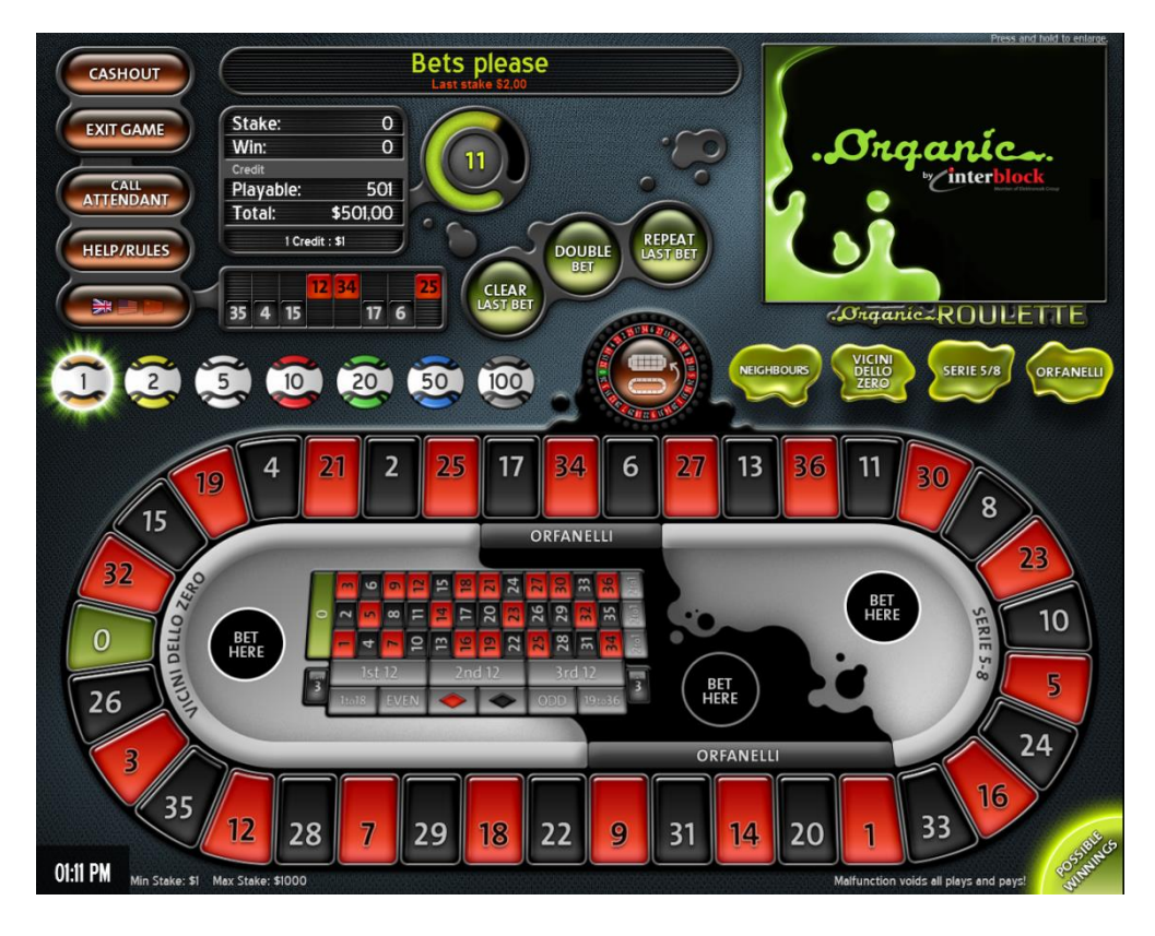
Diagram "D" Roulette Racetrack Layout