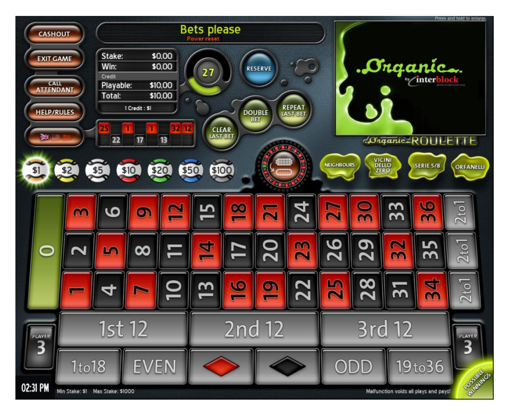
Diagram "C" Roulette Screen Layout