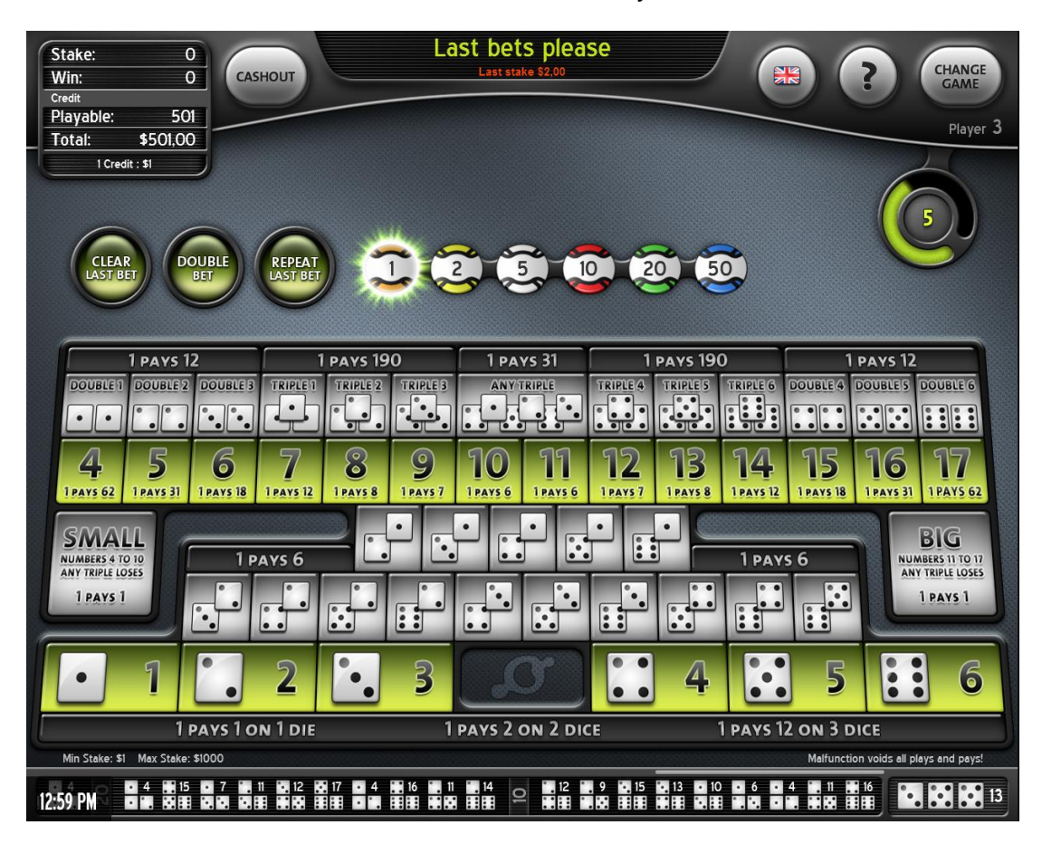
Diagram "E" Sic Bo Screen Layout