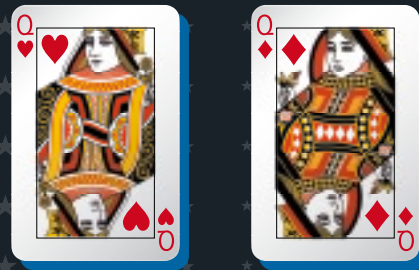
COLOURED PAIR (B)