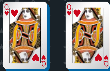
PERFECT PAIR (C)