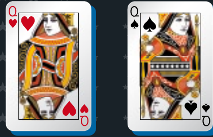
MIXED PAIR (A)

Perfect Pair (C) Two cards of the same number or picture type and suit eg. Queen of Hearts and Queen of Hearts PAYS 30 TO 1