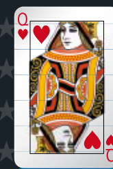
PERFECT PAIR (C)