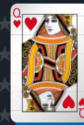
MIXED PAIR (A)